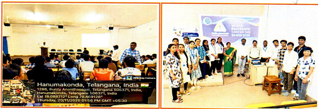
Caption:- "Raise Your Voice for the Voiceless – Support Pancreatic Cancer Awareness."